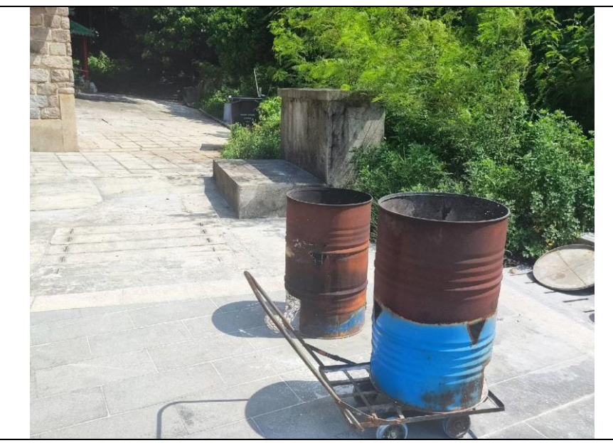
Photo 2 – The joss paper furnace was found next to the high volume sampler (HVS) at AM1. (Taken on 5 Oct 2022)